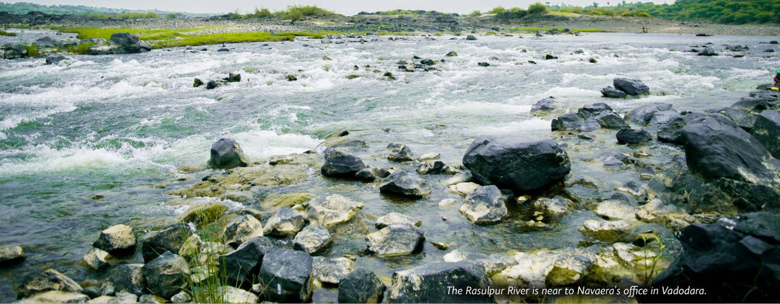
The Rasulpur River is near to Navaera's office in Vadodara.