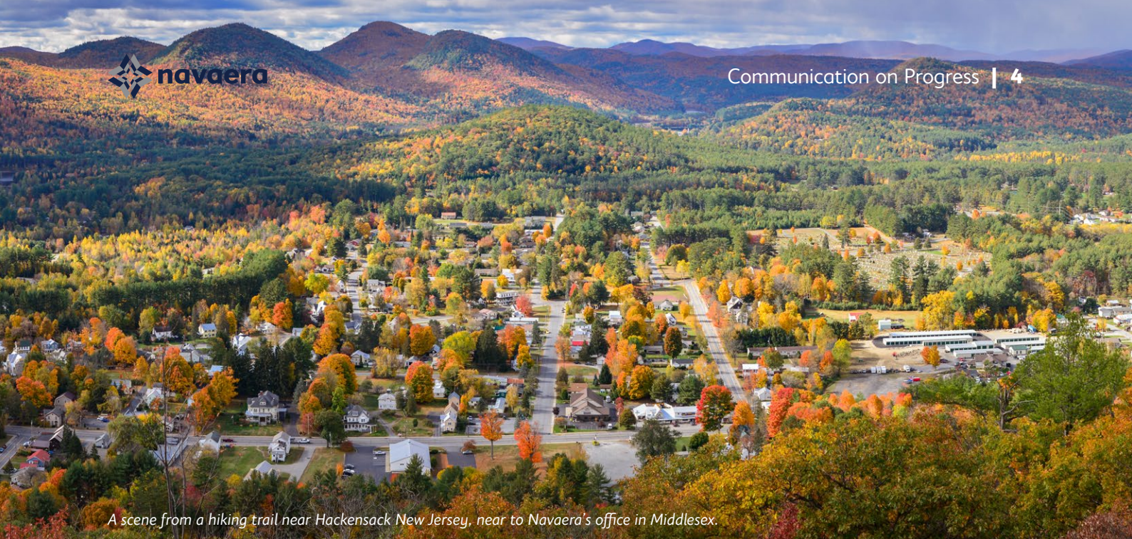
A scene from a hiking trail near Hackensack New Jersey, near to Navaera's office in Middlesex.