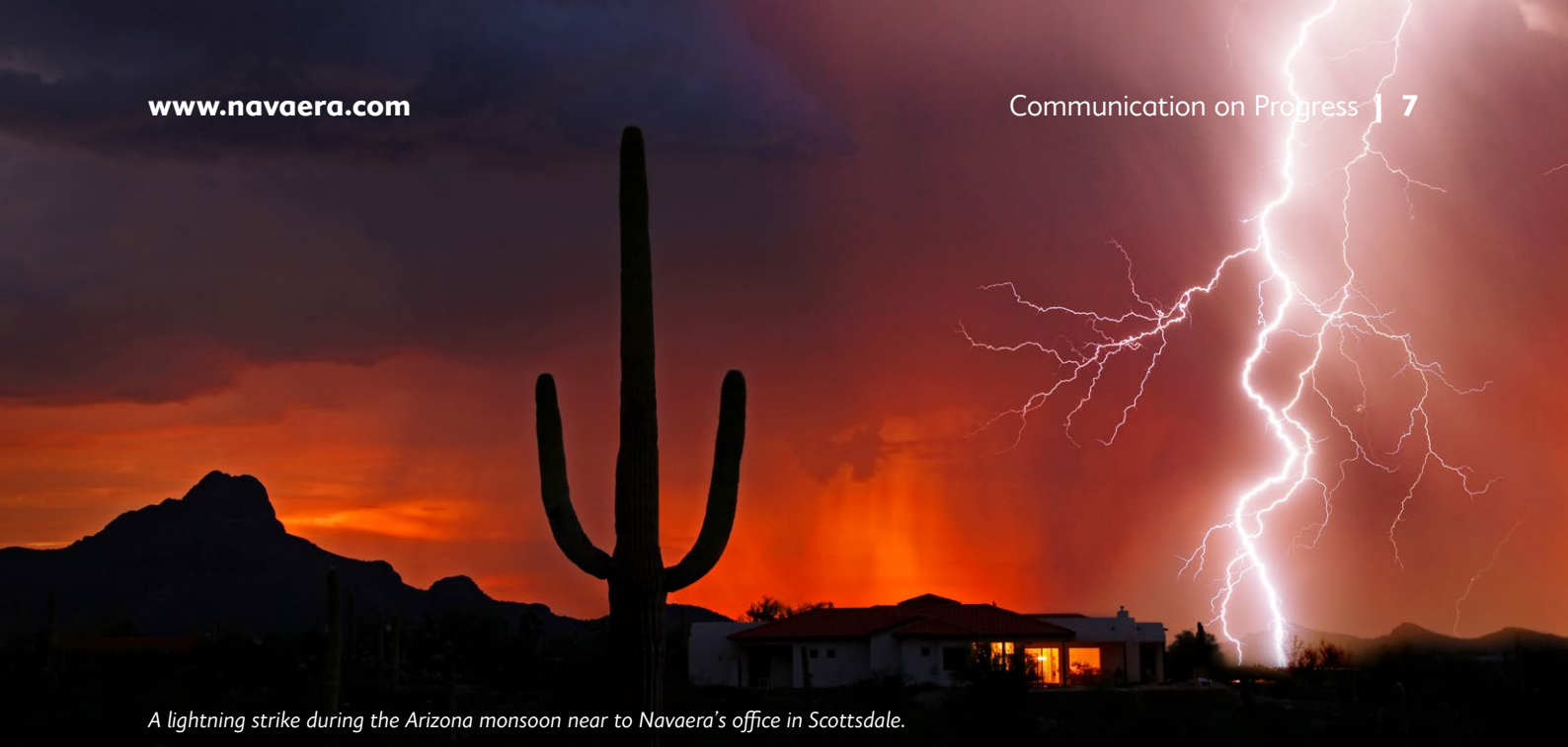
A lightning strike during the Arizona monsoon near to Navaera's office in Scottsdale.